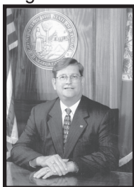
Charles H. Bronson Commissioner of Agriculture

A handwritten signature in black ink that reads "Charles H. Bronson".